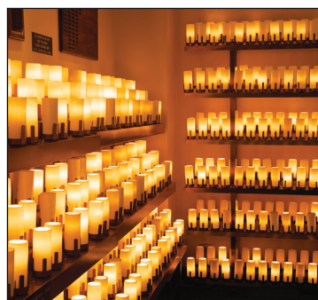
The Vigil Light room at the National Shrine.

My invitation to you today is to discover the many benefits of our St. Jude League in this national ministry of hope and devotion. We formed the St. Jude League in 1929 to ensure that the Claretian Missionaries had a ministerial organization dedicated to providing a constant path to a real connection with the National Shrine for their devotion to this Patron Saint of Hope—regardless of where they live or their ability to travel.